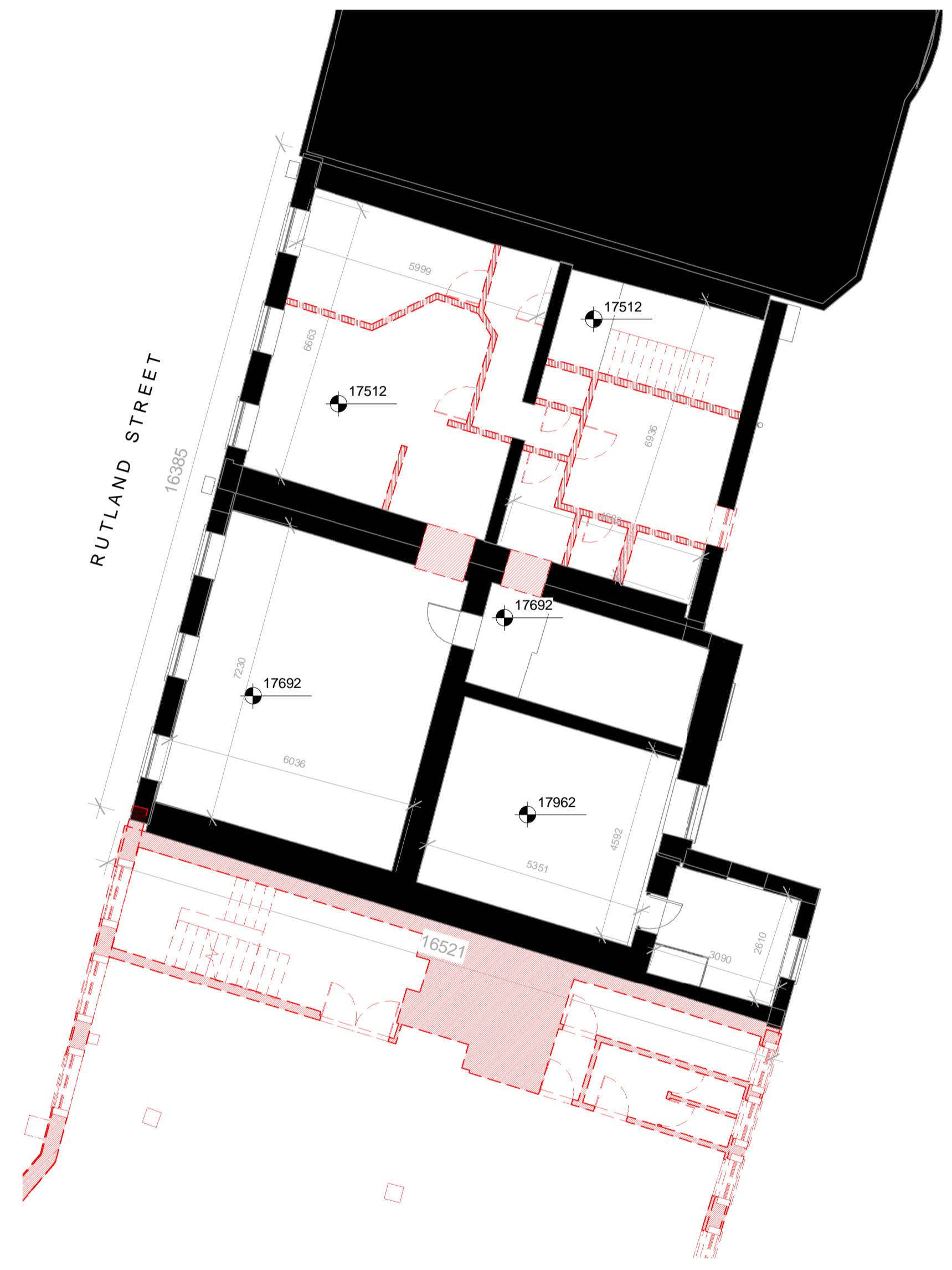
1 Demolition Third Floor Plan SCALE: 1 : 100

This drawing has been prepared for the use of AECOM's client. It may not be used, modified, reproduced or relied upon by third parties, except as agreed by AECOM or as required by law. AECOM accepts no responsibility, and denies any liability, whatsoever, to any party that uses or relies on this drawing without AECOM's express written consent. Do not scale this document. All measurements must be obtained from the stated dimensions.