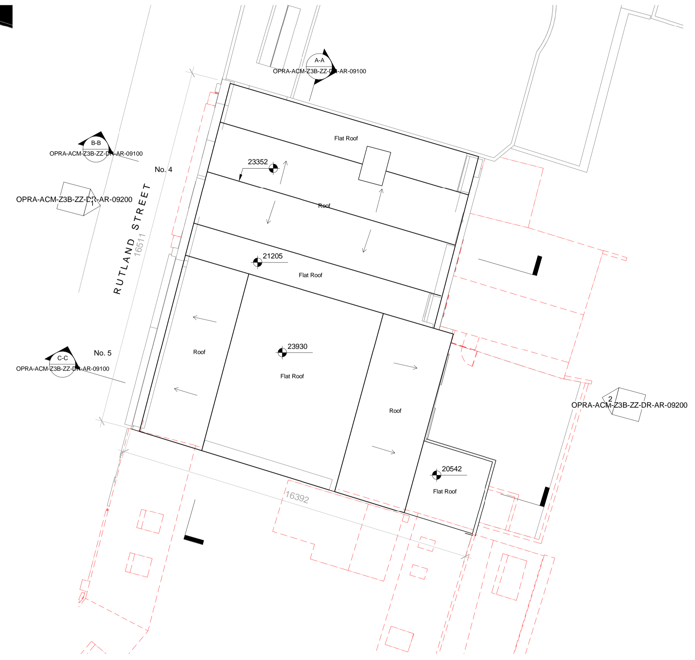
2 Demolition Roof Plan SCALE: 1 : 100